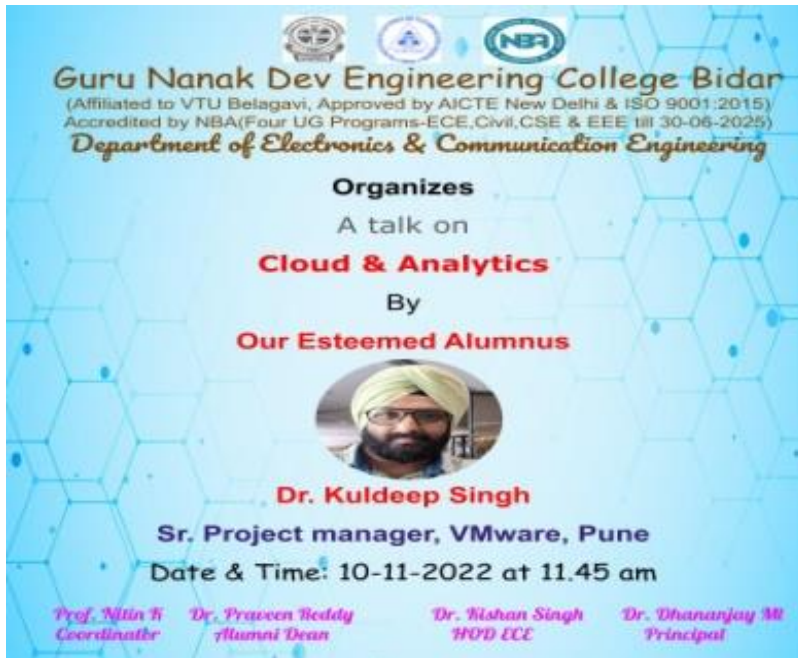
Cloud & Analytics on Guru Nanak Dev Engineering College, Bidar (ISF Activity) 10th November 2022