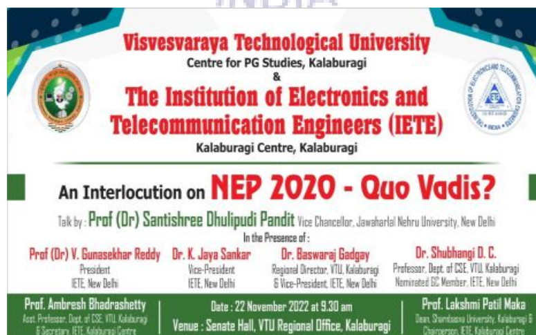
An Interlocution on NEP 2020-Quo Vadis? VTU Regional Office, Kalaburgi 22 nd November 2022