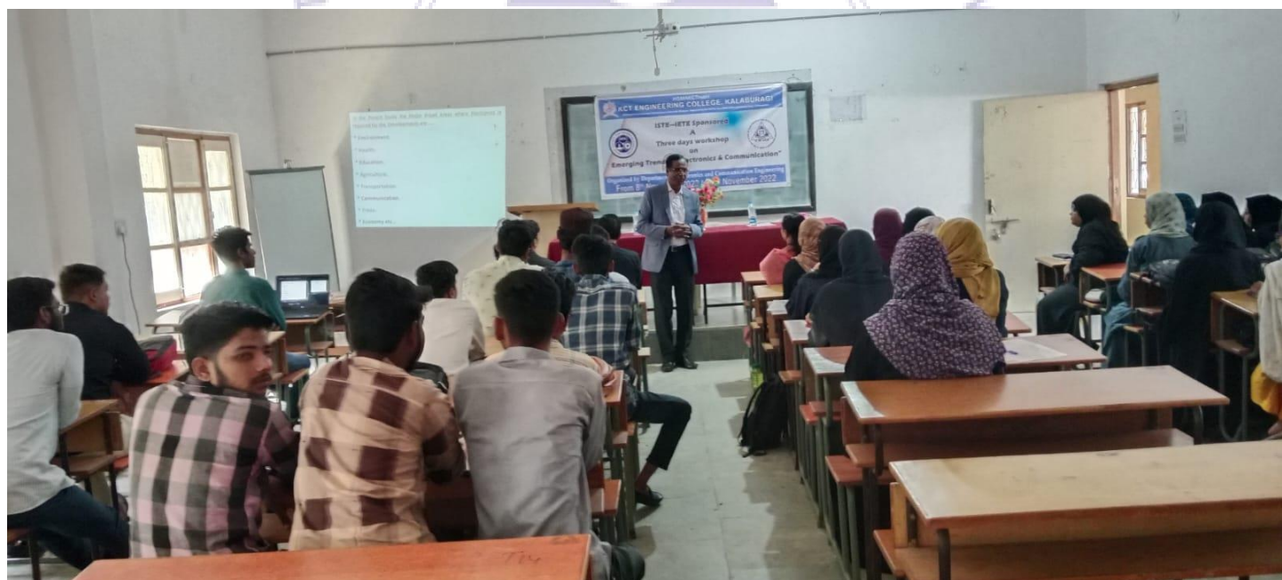
Glimpse of Emerging Trends in Electronics & Communication KCT Engineering College, Kalaburagi, 8th to 10th November 2022.