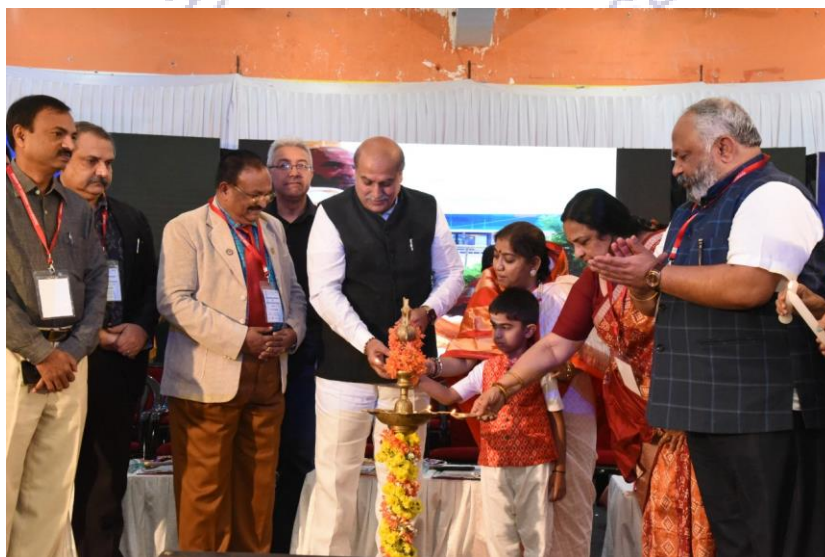
Inauguration of INTERNATIONAL CONFERENCE ON MULTIDISCIPLINARY RESEARCH (ICMR-2022) on 22 nd November 2022, Tuesday at 11:30 AM

The ICMR-2022 would offer several invited lectures from well-known speakers all over the world. We warmly welcome experts, academicians, scholars, and entrepreneurs to participate in this international academic exchange activity in the field of Emerging multi-disciplinary areas. We hope that the ICMR-2022 outcome will lead to significant contributions to the knowledge base in these up-to-date scientific fields. All the accepted papers will be sent to Journals of UGC Care/Scopus indexed/SCI indexed Journals.