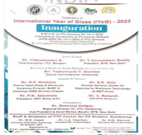
International Year of Glass-2022 on VTU Regional Office, Kalaburagi on 14th November 2022.