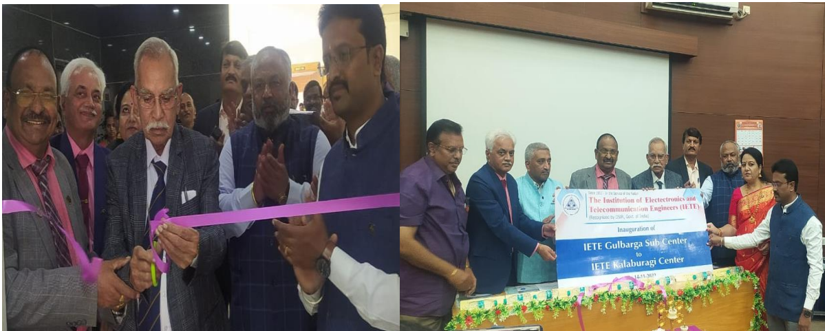
Inauguration of IETE Kalaburagi Centre by all Guests on 14 th November 2022, Wednesday at 12:00 PM