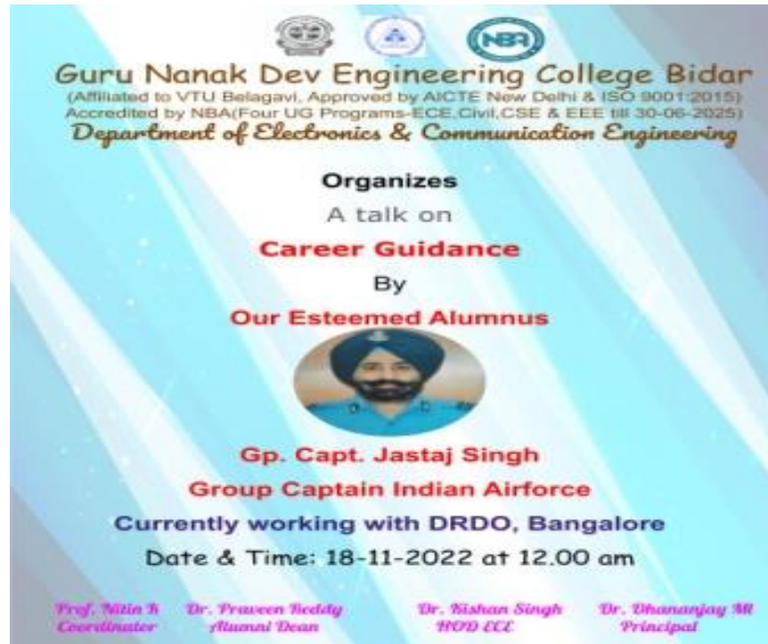
Career Guidance on Guru Nanak Dev Engineering College, Bidar (ISF Activity) 18th November 2022